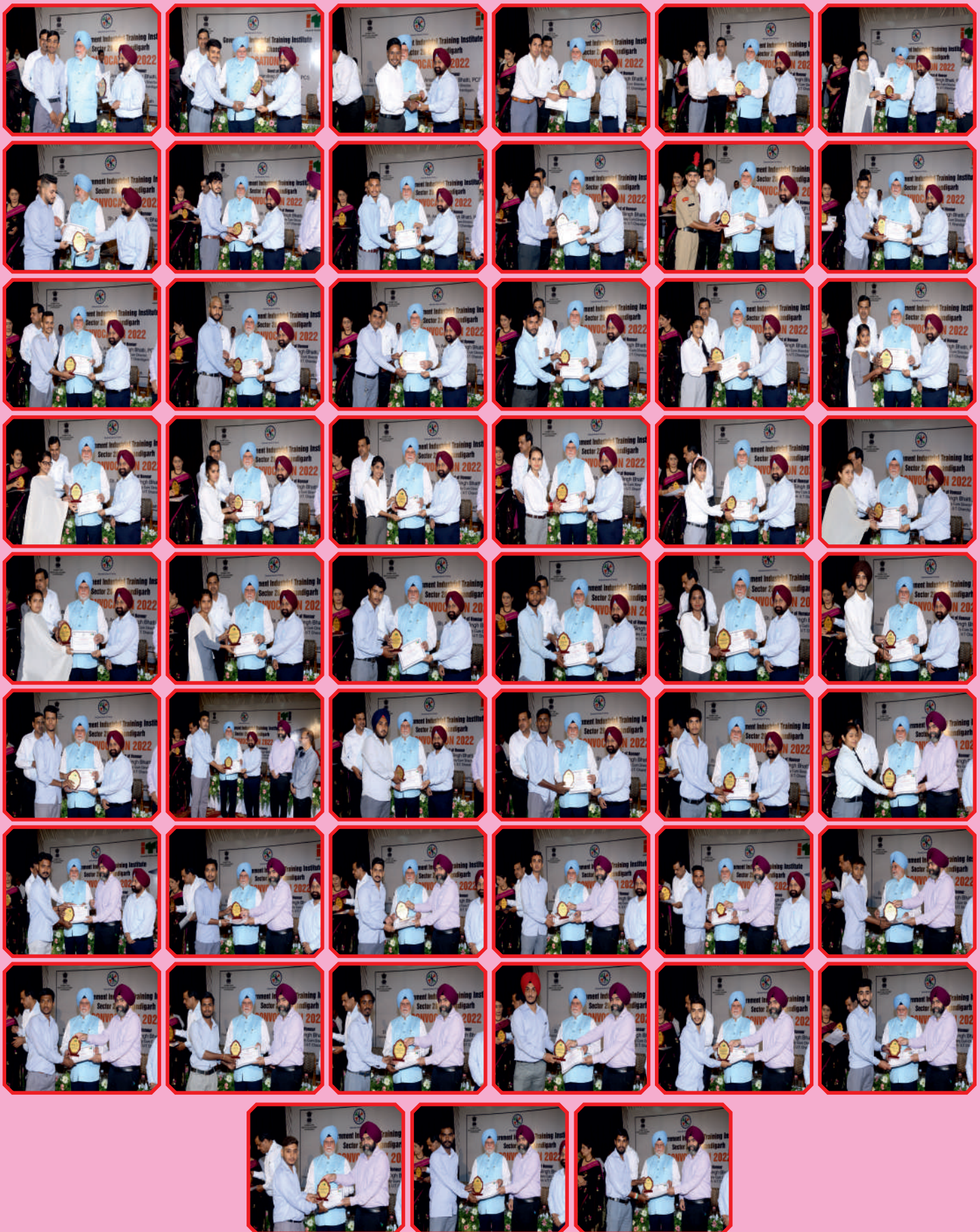
Prize & NTC Certificates Distribution among Trainees