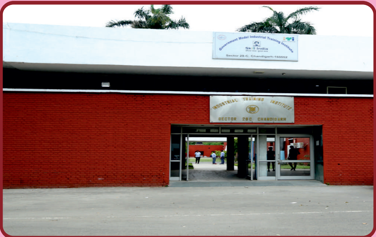
Govt. Industrial Training Institute, Sec. 28C, Chandigarh