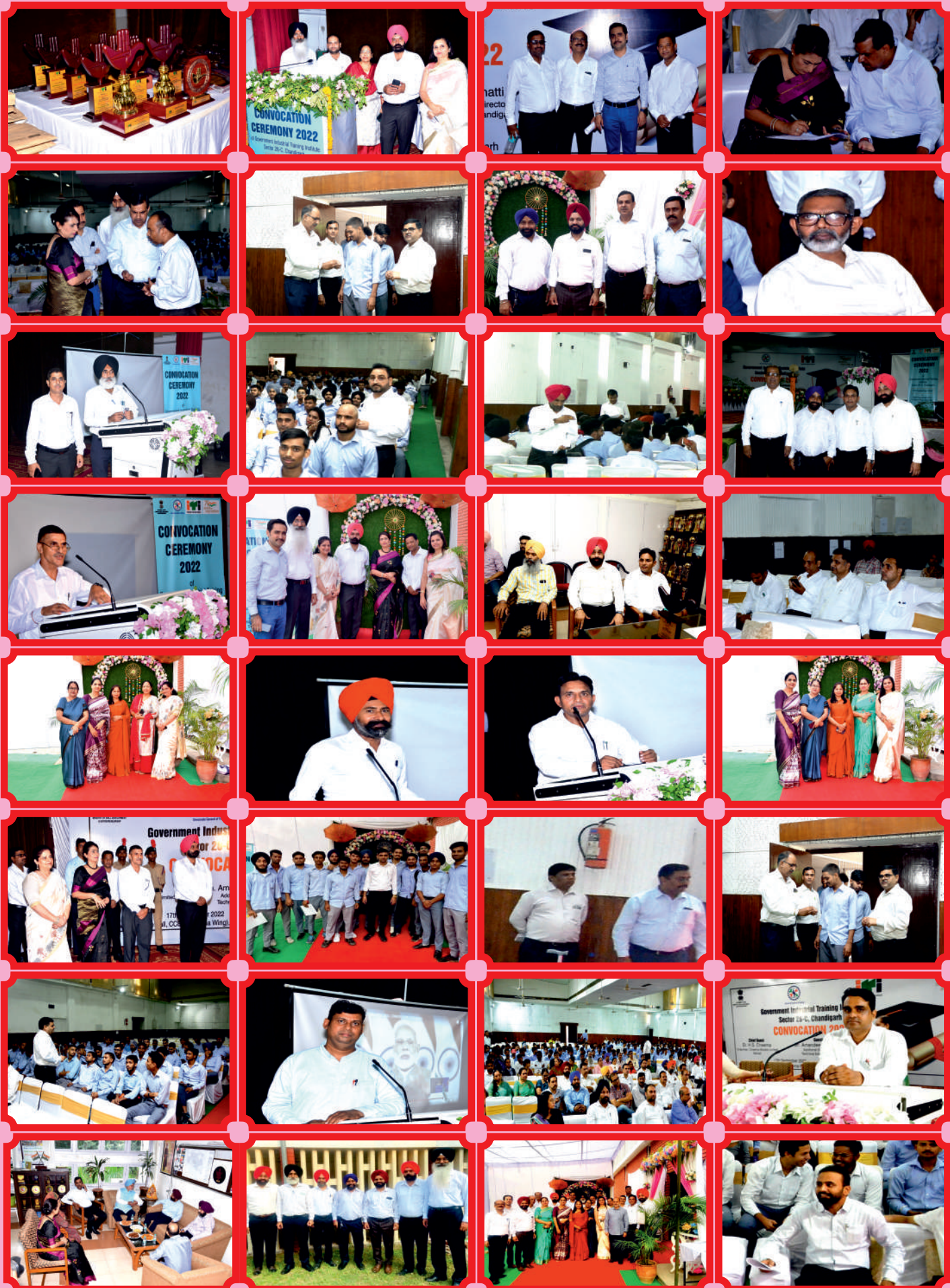
Some behind the curtain moments