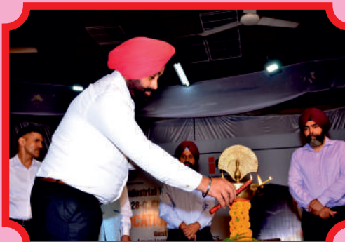
Lamp Lighting Ceremony spreaded divine grace